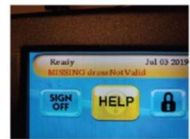
(Error message on GT1200)